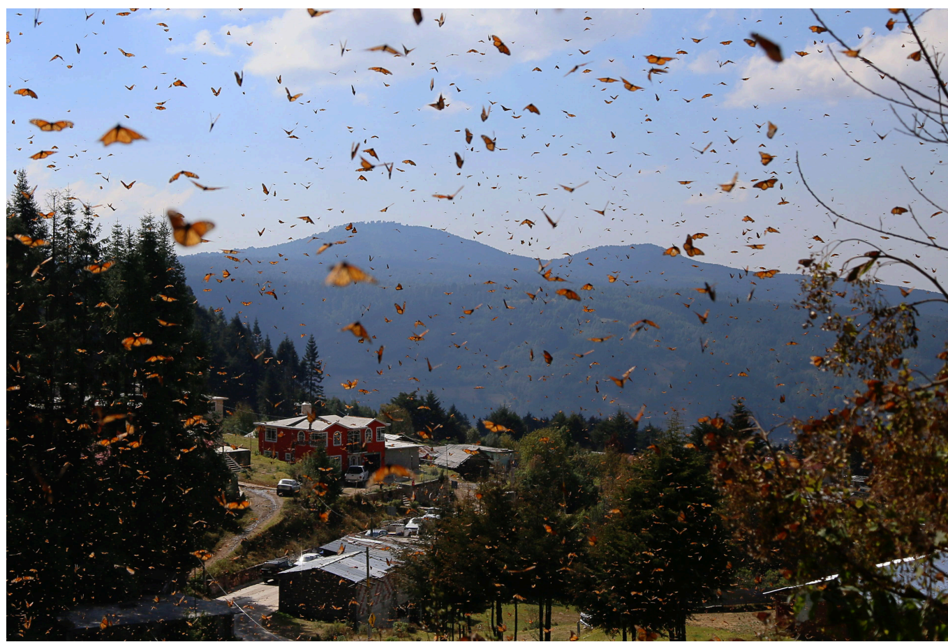
FLUTTER SPEED MEETS SHUTTER SPEED Monarch butterflies fill the air around the mountaintops in the Monarch Butterfly Biosphere Reserve, a UNESCO World Heritage Site in Michoacán, Mexico.

The migratory monarch butterfly, a subspecies of the monarch butterfly, was recently added to the IUCN's Red List as an endangered species, due to pressures from habitat loss and climate change.