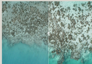
Coral growth at Palmyra Atoll

By stitching tens of thousands of photos from dozens of drone flights together, we can assess changes in coral reef health. In this image, drone imagery shows rapid coral growth from January 2022 (left) to November 2022 (right) at Palmyra Atoll. The dark patches are young coral colonies in the atoll's East Lagoon.