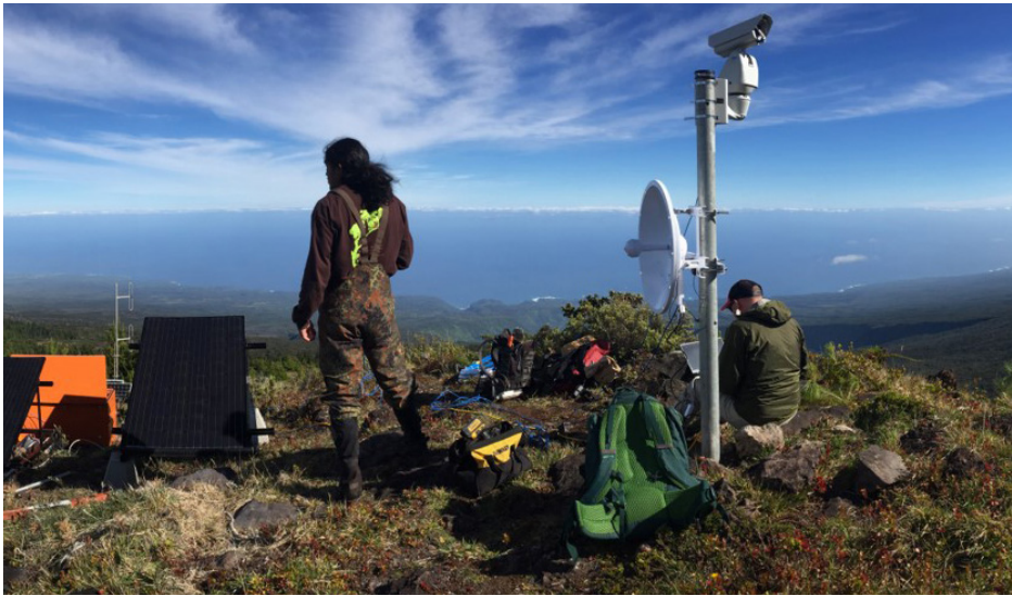
Technology innovation increases conservation efficiency.