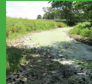
Oxbow before restoration