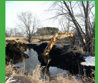
Oxbow during restoration