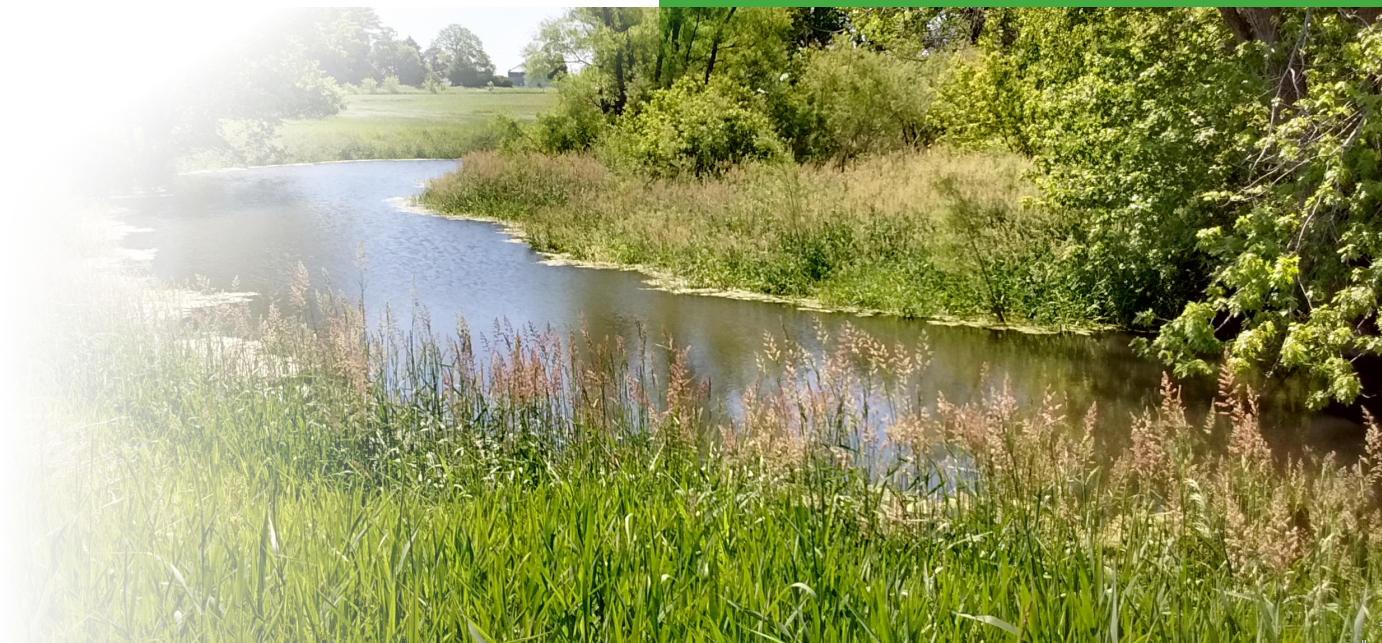
Oxbow after restoration