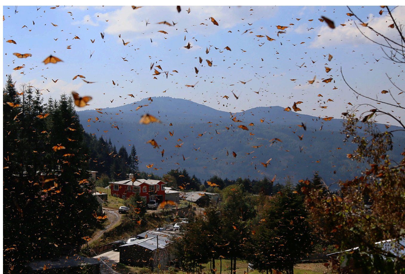
FLUTTER SPEED MEETS SHUTTER SPEED Monarch butterflies fill the air around the mountaintops in the Monarch Butterfly Biosphere Reserve, a UNESCO World Heritage Site in Michoacán, Mexico.

The migratory monarch butterfly, a subspecies of the monarch butterfly, was recently added to the IUCN's Red List as an endangered species, due to pressures from habitat loss and climate change.