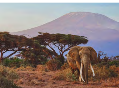
Kenya is well on its way to an updated NBSAP. TNC has been supporting government to draft national targets through multi-stakeholder process in a series of workshops held in 2023.