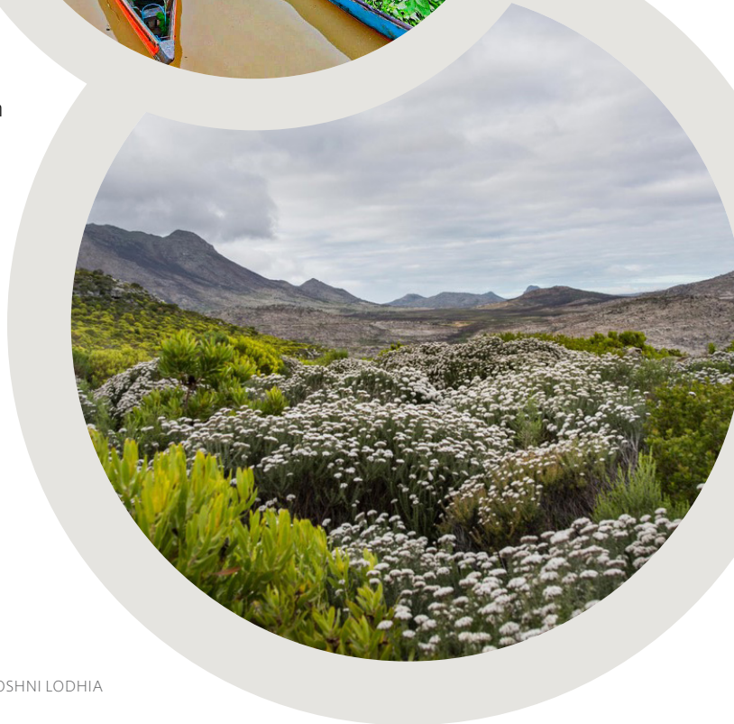
TOP: © MUHAMMAD GUNTUR AZMI/TNC PHOTO CONTEST 2021; BOTTOM: © ROSHNI LODHIA