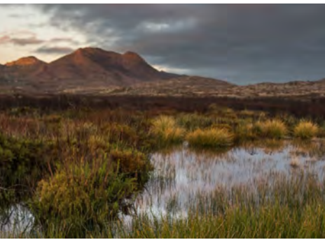
South Africa TNC has been working on restoration of the unique fynbos ecosystem in the Greater Cape Town region; we are now using this expertise to help connect the dots on freshwater, ecosystem services and restoration for South Africa's NBSAP update.