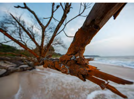
Gabon —TNC helped refinance $500 million of Gabon's national debt and generate an expected $163 million in new funding in support of protecting 30%—and improving management over 100%—of Gabon's ocean. This will help Gabon reach its ambitious Target 3 objectives.