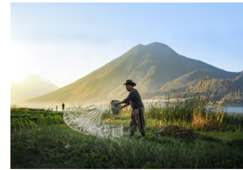
In Guatemala , TNC is working to incorporate the traditional Mayan knowledge on water management into the NBSAPs and freshwater outcomes for the Selva Maya region and the Mesoamerican Forest Bridge.

Other TNC country programs have focused on identifying climate-biodiversity linkages in support of Target 8 implementation. We are working to assess Nationally Determined Contributions (NDCs) and national adaptation plans under the Climate Convention and NBSAPs to ensure they are working coherently and synergistically. TNC commissioned a gap analysis to review options for synergies across these policy instruments in 20 countries in Asia, Africa and Latin America and Caribbean that will be available in early 2024. We hope this will help develop strong national climate and biodiversity policies that are mutually supportive.