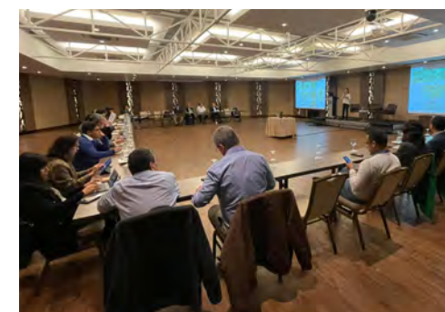
Peru —TNC has been supporting the Peruvian government on the development of a national infrastructure plan with environmental sustainability criteria, among them, ecosystem protection. This will minimize conversion of natural habitat in infrastructure development. We hope this can form the backbone of Peru's mainstreaming strategy in support of Target 14.